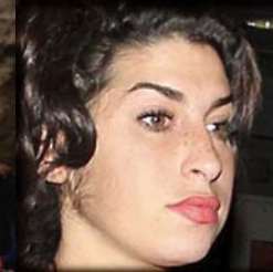
11. A duet with Tony Bennet released in September celebrates this contralto's Body and Soul.