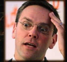
6. Amazement shows on the face of one who was 'kept in the dark' regarding a scandal that bugged him.