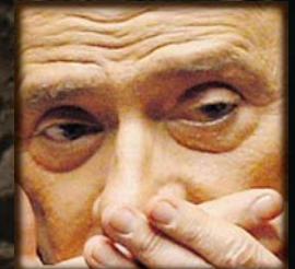
12. His broadcasting company, Mediaset, was a useful means of dominating the press and he resigned in 2011.