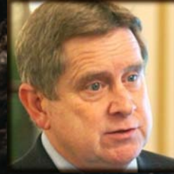
4. After quaking at an exciting prospect this CEO said it was unlikely to happen again!