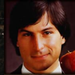
5. As a young man, this 'fruit salesman' had the look of one with a bit of confidence and vision.