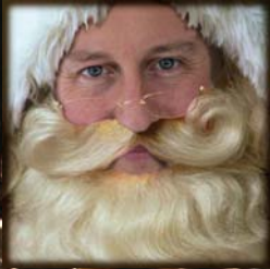
1. Disguised as Santa, is this Old Etonian wearing a hoodie or just wanting to hug one?