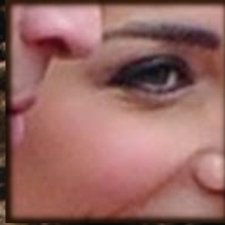
3. A resident of Bucklebury and a St Andrews graduate, she celebrated her big day in 2011.