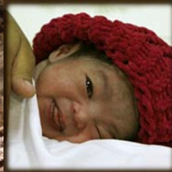
9. Her name isn't as important as her number - a significant, symbolic arrival on planet earth.