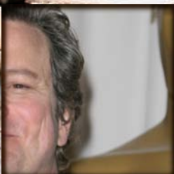
13. A major award for being in the best was no impediment to his acceptance speech.