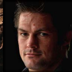
10. After several tries this dark horse tasted victory with his team.