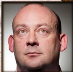
14. When God and Mammon meet there's always some fallout. Another resignation due to conflict.