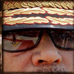
2. 'Loved by his people', who is this flamboyant leader.