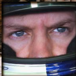
15. He celebrated being the youngest double winner and consecutive champion in his sport.

As we near Christmas and the end of 2011 we thought you might like a look back at some of the news but you'll have to work out the names and stories from the photos we've provided! See how you get on with our Advent Quiz.