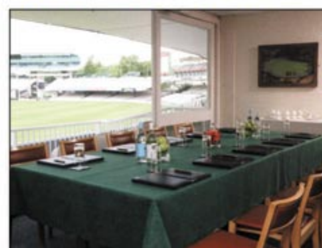
Lord's Cricket Ground, London NW8 8QN