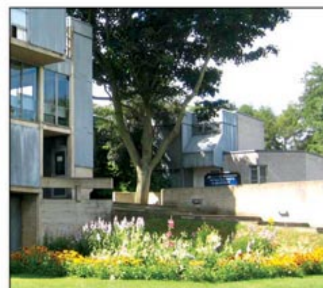
Saïd Business School Executive Education Centre Egrove Park, Oxford OX1 5NY